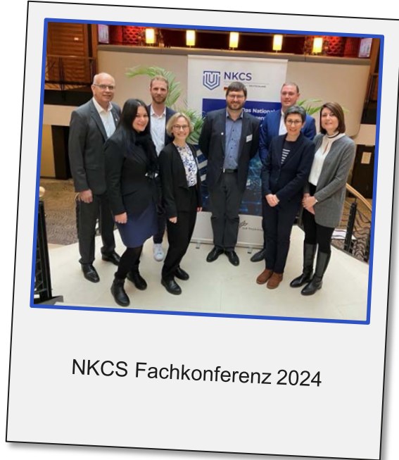
NKCS Fachkonferenz 2024