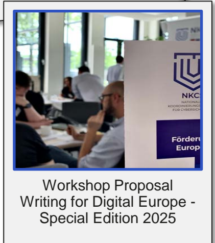
Workshop Proposal Writing for Digital Europe - Special Edition 2025